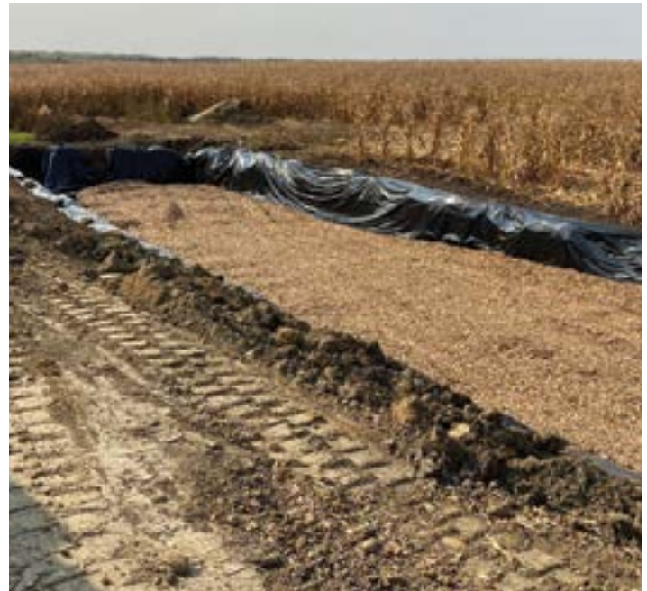
A bioreactor was installed near Lake City in the fall. A trench was dug, lined with a moisture barrier and filled with woodchips. The woodchips are covered with another moisture barrier and topped with soil. A tile line is routed from the field through the bioreactor to reduce nitrate-nitrogen from drainage water by 30 to 60 percent.